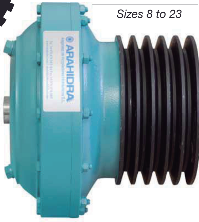
Sizes 8 to 23

Conveyer belts · Chain conveyers · Mixers and agitators · Shredders · Bead and hammer mills · Hoists · Traction lathes · Rotating dryers · Centrifuges · Pumps and ventilators · Etc.